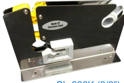
SL-606K (3/8") Stainless Steel